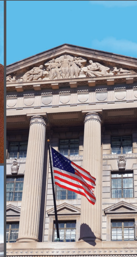
Herbert Hoover Federal Building/ Department of Commerce

Upgrade Your Facility with Interior Insulating Window Solutions