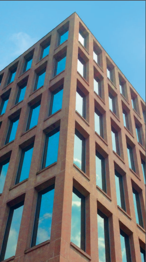
Theodore Roosevelt Federal Building/Office of Personnel Management