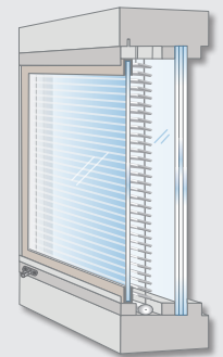
Also available with Encapsulated Blinds.

Maine Glass has partnered with Grunley Construction, Gilbane Construction, and Honeywell Building Solutions to successfully complete these Federal projects. For more information on our products or to request EnergyPlus™ modeling at no cost to you please contact us at www.maine-glass.com .